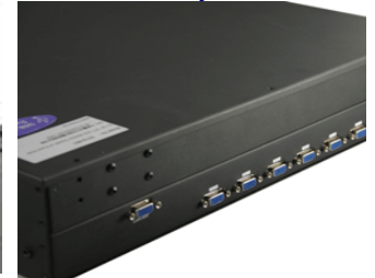
Rear 16-ports KVM