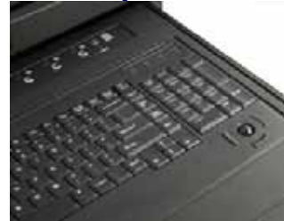
USB KVM Cables