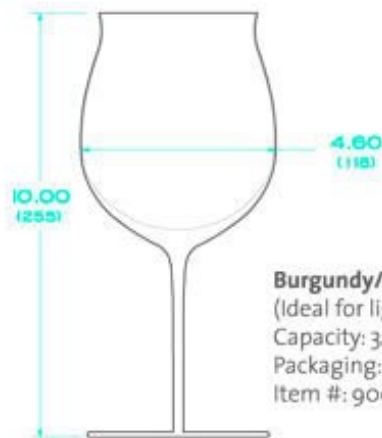
Burgundy/Pinot Noir Wine Glass (Ideal for light to medium-bodied reds) Capacity: 34 oz (1123 ml) Packaging: Set of 4 Item #: 9001