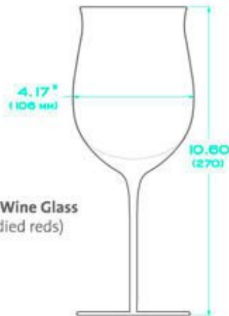
Bordeaux/Cabernet/Merlot Wine Glass (Ideal for medium to full-bodied reds) Capacity: 33 oz (1090 ml) Packaged: Set of 4 Item #: 9003