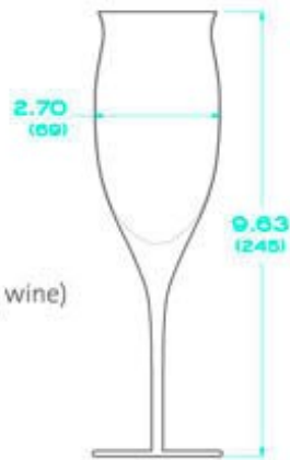
Champagne Glass (Ideal for Champagne or sparkling wine) Capacity: 12 oz (397 ml) Packaged: Set of 4 Item #: 9002