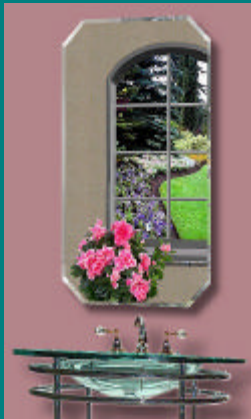
SPACECAB ASCELLA Beveled Octagon