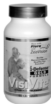
VisiVite® i-Defense Gold Formula

Every three months, you'll save nearly $14.00 and the inconvenience of placing a new order!