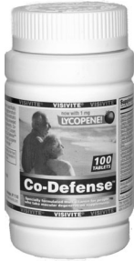
Co-Defense Multivitamin Tablets