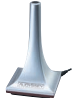
Microphone for Audyssey

The lesser-used controls are neatly tucked away behind the drop-down panel.