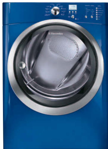
Mediterranean Blue EIGD55H MB