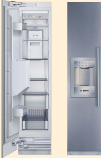
Integra Freezer B18ID80SL/RS – Stainless Steel B18ID80NL/RP – Custom Panel