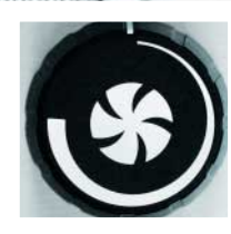
18" CANOPY RANGE HOOD – 48", 36", 30" E488WV120S, E368WV60ES, E308WV60ES professional series