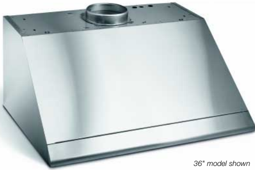
36" model shown