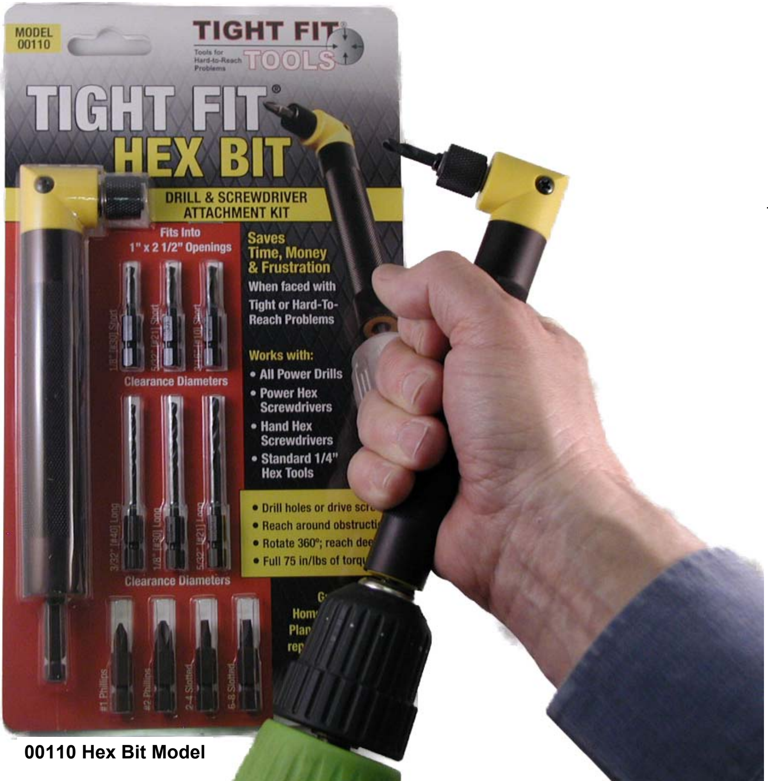
00110 Hex Bit Model