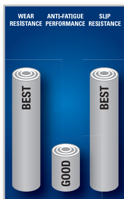
RESULTS from INDEPENDENT TEST LABS & PRESENTED as COMPARISONS to OTHER NoTRAX® INDUSTRIAL MATS