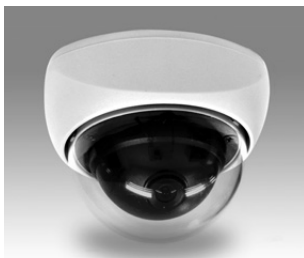
NVCC-D28N-IC : Ivory Housing w/ Clear Dome