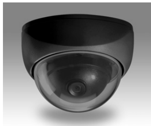
NVCC-D28N-BS : Black Housing w/ Smoked Dome