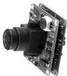
2-Board Camera Module