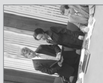
Tilted View with 2-Axis Bracket