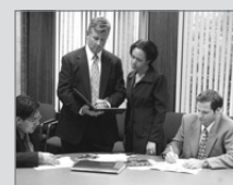
Perfect View with Ball Bracket