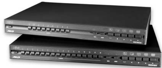
MX4009CS (TOP), MX4016CS (BOTTOM)

The Genex ® high performance, color simplex multiplexer utilizes the latest in digital video processing technology, providing high-quality recordings or outstanding multi-camera displays.