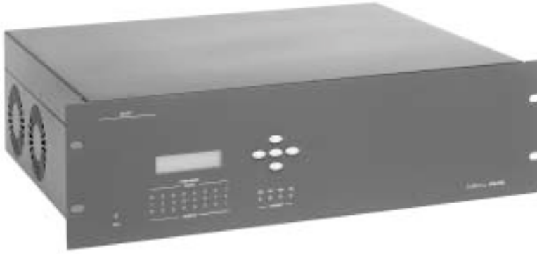
The Calibur DVS e can hold up to eight 80-GB* hard disk drives (HDDs). Each HDD can store up to 592 days of recordings.

The Calibur™ DVS e is a digital video storage system that provides extended storage capacity to the Calibur™ DVMR e (Digital Video Multiplexer/Recorder). Designed exclusively for the CCTV security industry, this inexpensive desktop or rack-mountable disk array offers flexible solutions for extended storage and easy retrieval of digitized, compressed video data.