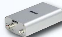
ZV-S306 Single-Channel Video Server