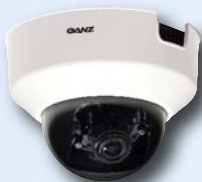
ZN-D2024 Series Network Dome