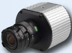
MP Series Megapixel Cameras