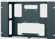
MB-526 Mounting Bracket (for LMD-1410SC)