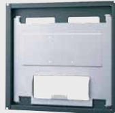
MB-527 Mounting Bracket (for LMD-2010SC)

© 2005 Sony Corporation. All rights reserved. Reproduction in whole or in part without permission is prohibited. Features and specifications are subject to change without notice. All non-metric weights and measurements are approximate. Sony is a registered trademark of Sony Corporation. VESA is a trademark of the Video Electronics Standards Association. VGA is a registered trademark of International Business Machines Corporation, U.S.A.. All other trademarks are the property of their respective owners. CA-LMD-1410SC/LMD-2010SC/GB- / /2005