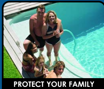
PROTECT YOUR FAMILY