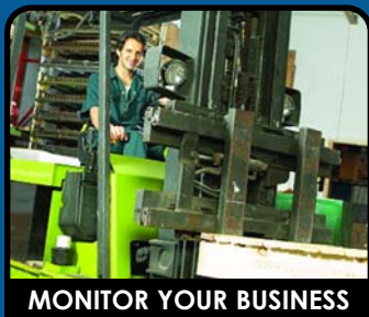
MONITOR YOUR BUSINESS