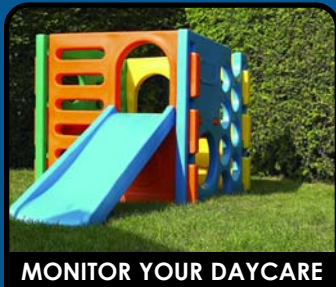
MONITOR YOUR DAYCARE