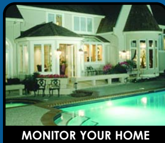
MONITOR YOUR HOME