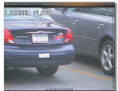
Live monitoring with instant investigation in Ocularis Client Lite

Built for Convergence OnSSI's open-architecture technology allows for seamless convergence with security, retail and other organizational systems. Simple-to-use APIs enable integrating NetDVMS with Access Control, Contact Closure, Fire Alarm Panels, Emergency Phones and most other IP-based systems, to create a true alarm, alert and event management system.