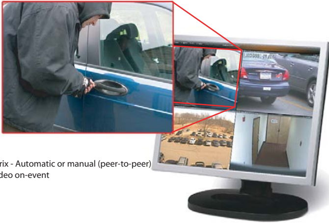
NetMatrix - Automatic or manual (peer-to-peer) push video on-event

Video Intelligence and Content Analytics With more video content streaming from ever-growing camera systems, the need for video intelligence has become imperative. Video content analytics allow the same number or fewer security operators to address the continually growing amount of video data. OnSSI's open-standards connectivity with physical security devices enable detecting events and exceptions, based on rules, automatically and in real time. Video Content Analytics modules add a higher level of recognition of exceptions and movement patterns, including directional movement, unattended objects and vehicles, motion tracking, crowd behavior and more. The result is the efficient and automatic detection of events and exceptions that are streamed to users - automatically - through intelligent remote, web and mobile video clients/controllers.