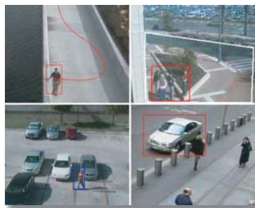
Video Content Analytics

Full Interaction with camera, including playback controls, optical and digital PTZ