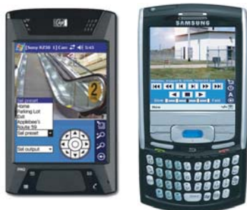
NetPDA & NetCell

PTZ-enabled Handheld IP Video clients/controllers