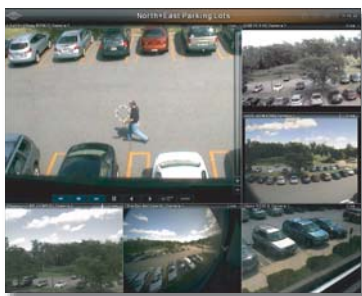
Instant Investigation during Live Monitoring

Access, investigate and export video of any incident within seconds