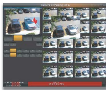
Time Slicer and Kinetic Motion Timeline

PTZ-enabled Handheld IP Video clients/controllers