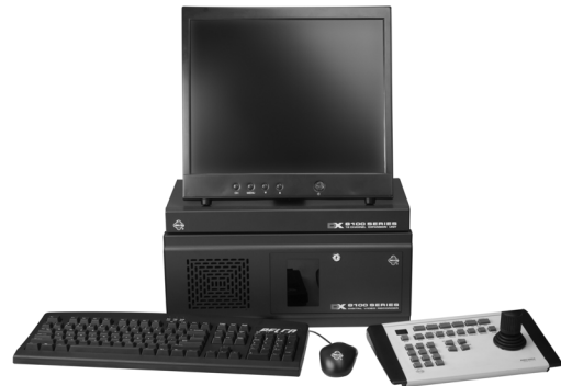
(THE KBD300A IS NOT INCLUDED.)