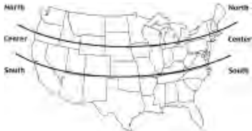
Fig 5d – Zone Map