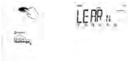
Fig 11c – Press the PROGRAM button