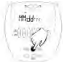
Fig 4a – CAL mode