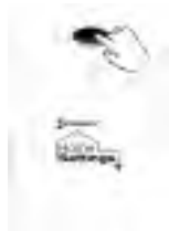
Fig 8b – Press the PROGRAM button