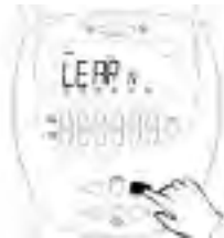
Fig 11b – Press and hold the DELETE button