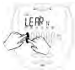
Fig 9a – Press and hold the channel ON and OFF buttons. Release buttons when “LEARN” is shown in the display.