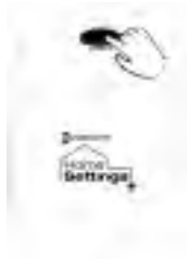
Fig 9c – Set the desired light level by pressing the PROGRAM button on the module. Release the INCLUDE button on the controller when the light level is set.