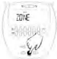
Fig 5c – Press ENTER to accept zone setting.