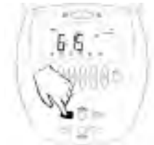
Fig 8a – Press and release the INCLUDE button

Repeat steps 1 and 2 for each module you wish to add to the network.