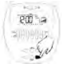
Fig 14a - Press the MODE button Fig 14b - Press the + button