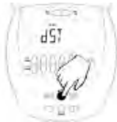
Fig 5a – SETUP mode