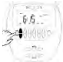
Fig 12 – Press the ON or OFF button