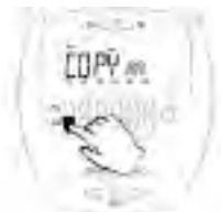
Fig 16d - Press and release the Channel 1 ON/DIM button on the Secondary Controller . "RA" which stands for "Receive ALL data" will be shown next to "Copy".