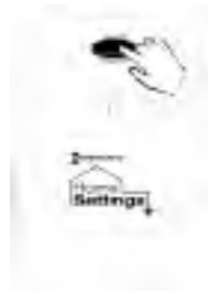
Fig 13c – Press the PROGRAM button