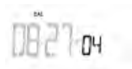
Fig 4d – Set Year