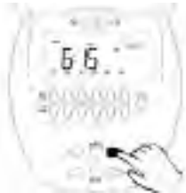
Fig 10a – Press and release the DELETE button

(See Fig 10a and 10b) Follow the same procedure as Creating a Network (see page 14) except press the DELETE button instead of the INCLUDE button.