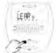
Fig 9b – Press and hold the INCLUDE button.