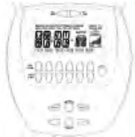
Fig 1. LCD display and button configuration.

Device – Any item that is connected to a module (for example, lamps).