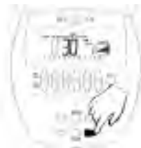
Fig 14d – Select the minutes