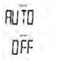
Fig 5b – dST setting