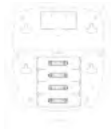
Fig 2. Battery compartment