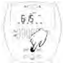
Fig 15 – Press the MODE button to select operation method

(See Fig 15) When you have completed your PROGRAM settings, press MODE.