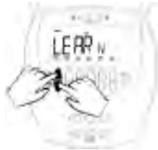
Fig 11a – Press the channel ON and OFF buttons

(See Fig 11a – 11c) Follow the same procedure as Associating Modules to Channels (see page 16) except press the DELETE button instead of the INCLUDE button.