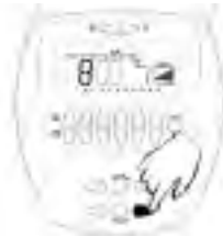
Fig 14c – Select the hour