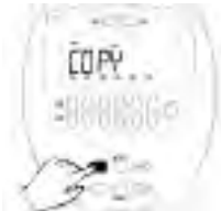
Fig 16c - Press and hold the INCLUDE button on the Secondary Controller . "Copy" will be shown in the LCD display. Release the INCLUDE button.