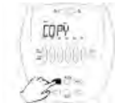
Fig 16a -Press and hold the INCLUDE button on the Primary Controller. "Copy" will be shown in the LCD display. Release the INCLUDE button.

The controllers will automatically synchronize with each other and the word "SUCCESSFUL" will flash for 2 seconds on the display (for HA09 Handy Controller, success is indicated with a solid green LED for 2 seconds). If not successful, the words "NOT SUCCESSFUL" will be displayed for 2 seconds (for HA09 Handy Controller, the red and green LED's will flash for 2 seconds).