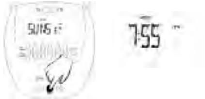
Fig 7 – SUNSET default time may be different than shown above. Press ENTER to accept the default time.