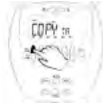
Fig 16b - Press and release the Channel 1 ON/DIM button on the Primary Controller. "TA" which stands for "Transmit ALL data" will be shown next to "Copy".