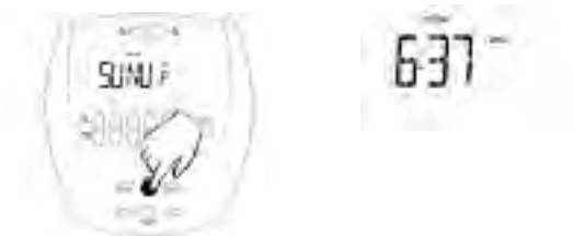
Fig 6 – SUNUP default time may be different than shown above.