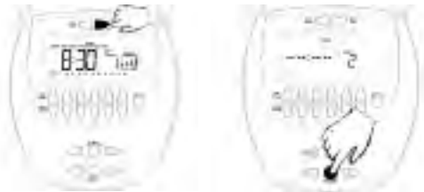
Fig 14f - Press and release ALL ON to use SCENES (preset light levels) Fig 14g - Press ENTER to accept settings and step to the next event

CONGRATULATIONS! You have completed the programming of your HA07 Master Controller.