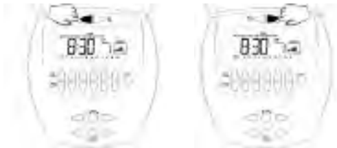
Fig 14e – Press and hold ALL OFF or ALL ON to set the desired light level