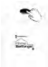
Fig 10b – Press the PROGRAM button