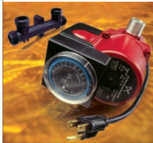
INSTANT HOT WATER using a single pump at the water heater and a patented bypass valve at the point of use.

AVAILABLE AT: WWW.REWCI.COM TOLL FREE: 888-845-6597