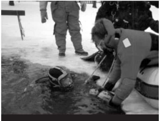
Photo 1-2 Public safety dive teams do not choose dive times or locations.

In the world of public safety diving, there is no “safe” ice. If ice was safe, chances are that public safety divers would never need to be called. If a child fell through the ice, responding personnel will not be able to walk, stand, kneel, or sometimes even crawl on