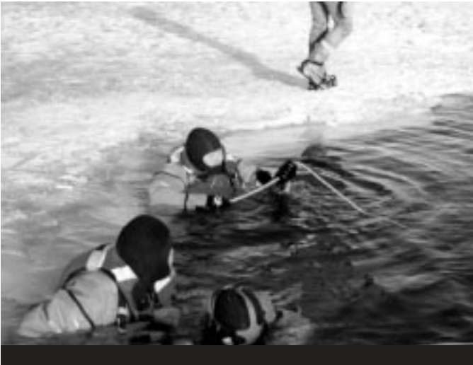
Photo 1-3 Dive team members learning how to work in unsupportive ice. Tenders and contingency divers stationed in the water.

the ice. Rescuers often start falling through the ice long before reaching the victim's point of entry. Lacking sufficient training and equipment, the average ice diving operation begins to fall apart before it even gets started.