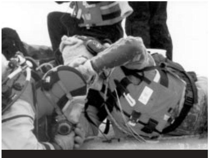
Photo 1-4 Well-trained tenders, proper tethering, and the right equipment are keys to a safe operation.

The only thing that went right, most likely by accident, was that the dive instructor’s wife, who had medical training, performed basic life support that saved the instructor’s life. They still believe they did almost everything right and this incident was just something that could not have been helped. We believe the media often promotes the reoccurrence of such situations by confusing ignorance and heroism.