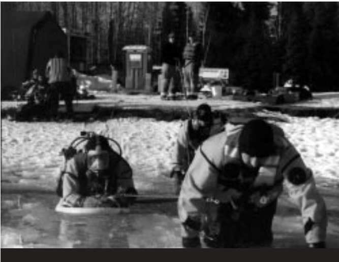
Photo 1-1 Ice diving operations require specialized equipment, procedures, and highly trained surface support.

Although ice diving is technical diving, it is not the recreational technical diving associated with mixed gas and untethered deep diving. Rather, it is technical because it requires advanced specialized training, formal procedures, special equipment, and well-trained surface support. Public safety ice diving operations require even more highly advanced training and equipment.