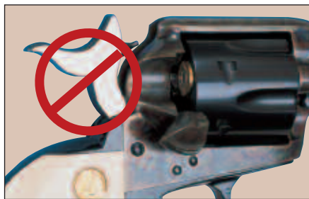
Pin to rest on empty chamber

All firearms are potentially dangerous. Their use may cause great harm, personal injury or death. For your own safety and the safety of others, it is your responsibility to carry and handle a firearm safely. Proper training is available through accredited firearms safety programs conducted through police departments, the military, state-run hunter safety programs, and other agencies such as the National Rifle Association. Do not carry or use a firearm without a thorough knowledge of its characteristics and safe use in the circumstances in which you intend to use it. It is also your responsibility to be certain that your firearm is in proper, safe operating condition.