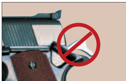
Be sure firearm is not cocked when placing in holster