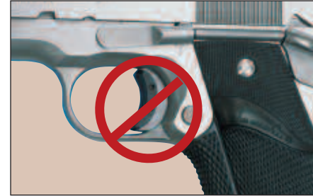
Do not use trigger shoes

It is also your responsibility to regularly check your holster, including any retaining strap, snap and spring or other retaining device, for precise fit and performance. Should your holster become ill-fitting, worn, loose, or defective at any time, cease use immediately.