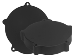
"Orange" Light Covers (2)