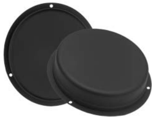
IR Headlight Filters (2)