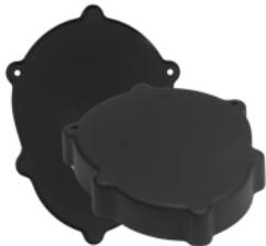
IR Brake Light Filters (2)