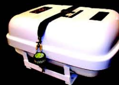
Container & Cradle