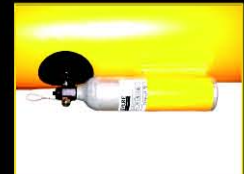
Detail of CO 2 Cylinder