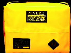
4 Person Valise