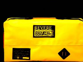
2 Person Valise