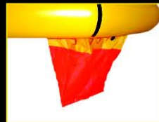
Detail of Ballast Pockets