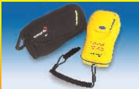
Carry case and lanyard