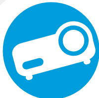
Epson PowerLite Pro Cinema 1080 or 1080 UB

Buy an Epson PowerLite® Pro Cinema 1080 or 1080 UB between April 1, 2009 and May 31, 2009 and receive the following back by mail: