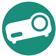
Epson PowerLite Home Cinema 1080 or 1080 UB