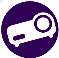
Epson PowerLite Pro Cinema 1080

Buy an Epson® PowerLite® Pro Cinema 1080 together with any projector screen (valued at $300 or more) and get the following back by mail: