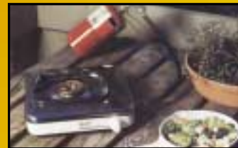
RETS-INEA Single Cook Top Dimensions: 4"H x 11 1/2"W x 11 3/5"D Weight: 4lbs.