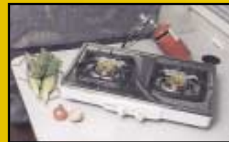
RET-2KR Dual Cook Top Dimensions: 5 1/2"H x 22"W x 14"D Weight: 12lbs.