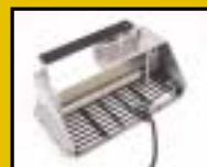
Fan Kit REH-19D-200 Tropic Blower