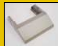
REH-19D-150 Bantam & Tropic