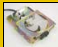
Fan Kit REH-18-60