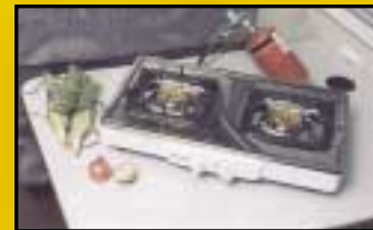
RETS-320NA Dual Cook Top with Broiler Dimensions: 8 1/2"H x 22 1/8"W x 17 1/2"D Weight: 17.25lbs.