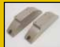
Base Leg S0-001-0461 Equator, Bantam, Tropic, Azure