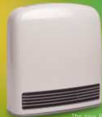
The new RCE-429A with 14,000 BTU's

Optional Custom Wall Mounted Kit Allows RCE-229A, RCE-329A, and RCE-429A to be wall mounted.