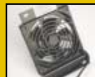
Fan REH-10-50 Equator, Bantam, Tropic, Azure