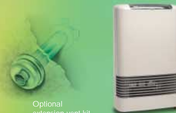
Optional extension vent kit

Rinnai is continually updating and improving products, therefore, specifications are subject to change without prior notice. Local, state, provincial and federal codes must be adhered to prior to installation. See owner's manual for complete specifications.