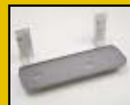
Silent Servant Wall Mount Kit RCE-229-550, RCE-329-550