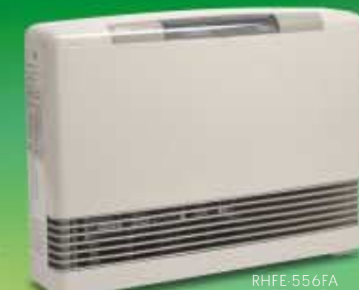
RHFE-556FA RHFE-431FA RHFE-556WTA RHFE-431WTA