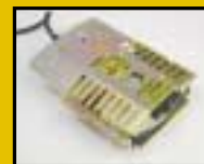
Fan Kit REH-18-161 Bantam I