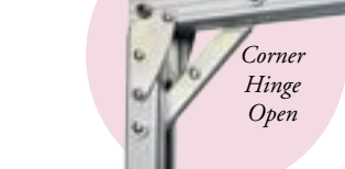
Corner Hinge Open