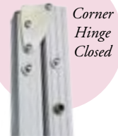
Corner Hinge Closed