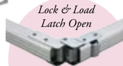
Lock & Load Latch Open