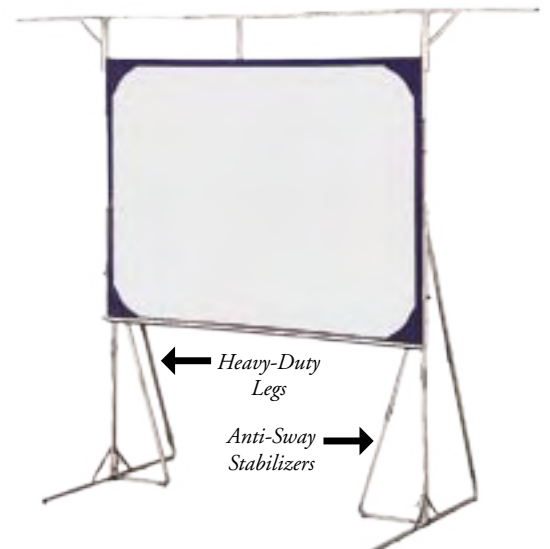
At right: Cinefold with Cineflex viewing surface, valance bar, drapery bars, skirt bar, optional Heavy-Duty Legs and optional Anti-Sway Stabilizers.