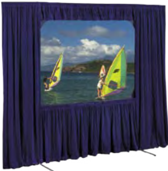
At left: navy velour drapes attached to a Cinefold with Cineflex viewing surface.