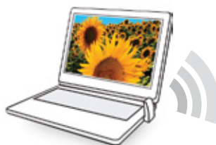
Wireless point-to-point connectivity of up to 30 feet / 10 meters between PC or laptop and DisplayLink™ enabled projector