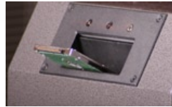
Laptop Hard Drives