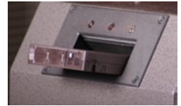
Tape Cartridges DLT, LTO, 8mm