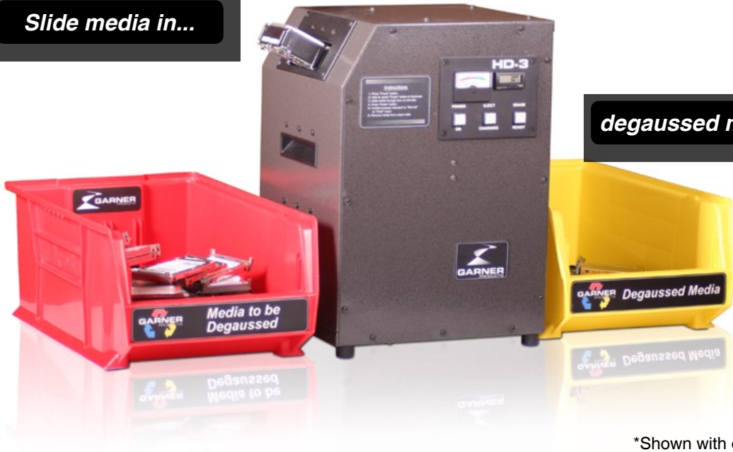
*Shown with optional media bins