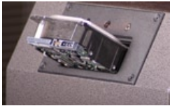
Large Hard Drives