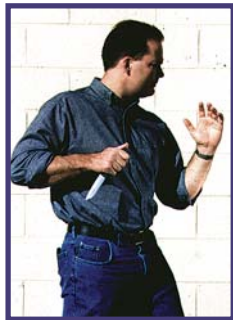
This stance puts the face and left side of the body in front of the knife hand where they can't be readily defended. Note how vulnerable the empty hand is.

Don't be fooled by the host of alleged experts, police trainers, gun writers, knife makers and knife manufacturers who have never seriously studied the fighting knife. Coming at you with false or misleading information can be as damaging as the sharpest of blades. We at Cold Steel have engaged in hundreds upon hundreds of hours of full contact knife sparring. That is what it takes to truly become an expert!