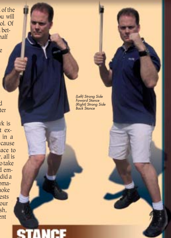
(Left) Strong Side Forward Stance (Right) Strong Side Back Stance

To assume this stance, take up a basic boxing position with your right hand forward (to you right-handed boxers, this is a southpaw stance). Grasp your tomahawk in a hammer grip near the bottom of the handle and extend it straight from the shoulder until your upper arm and lower arm form an L shape. Your gripping or strong hand should now be close to level with your right pectoral muscle, and your tomahawk blade will be about level with the top of your head. Make sure your weak shoulder is pulled back well to the rear. This will help in aligning your body so it presents a narrower target to the enemy. Also, remember to keep your left elbow in close and