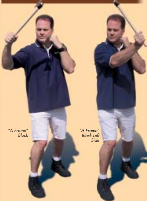
"A Frame" Block