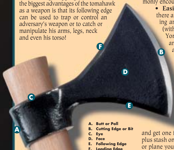
A. Butt or Poll B. Cutting Edge or Bit C. Eye D. Face E. Following Edge F. Leading Edge

• Cuts a Small Swath - Unlike a 12" kukri blade or 25" cutlass, the edge of the average tomahawk is quite short (seldom more than 4½" long) and thereby cuts a relatively small