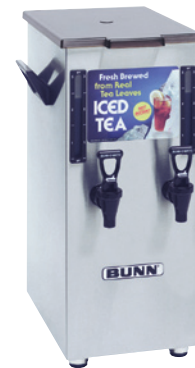
TD4T, Dual Reservoir

Dimensions: 22"H x 9.1"W x 15.7"D (55.9cm H x 23.1cm W x 39.9cm D)