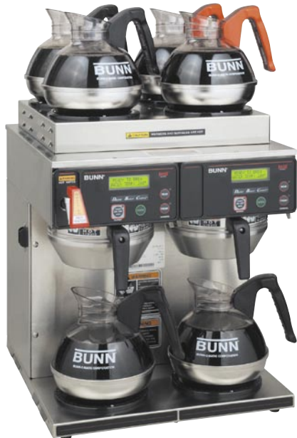
Model AXIOM 4/2 Twin (decanters sold separately)

Dimensions: 19.1" H x 16.4" W x 17.7" D (48.5cm H x 41.7cm W x 44.9cm D)