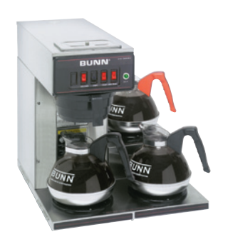
Model CWT15-3* (no faucet)

For current specification sheets and other information, go to www.bunn.com.