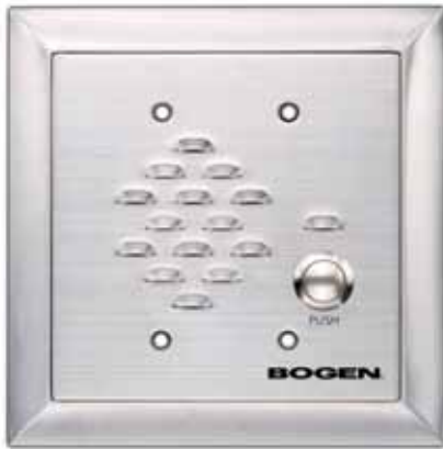
Shown with bezel frame (Included)