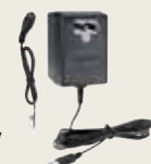
PRS2403 24V DC Power Supply