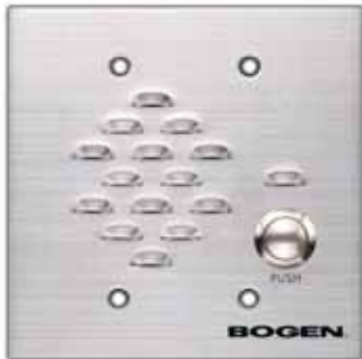
Shown without bezel frame