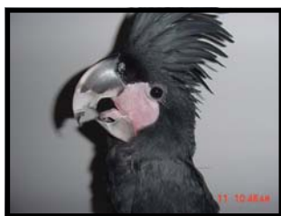
A rare black palm cockatoo.—Jasper

VISIT US ON THE WEB WWW.BIRDIEBOUTIQUE.COM