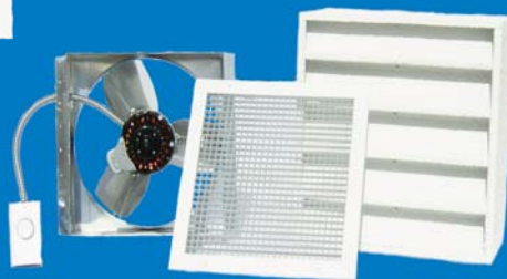
QC1500 GX Garage to exterior fan (This model does not cool attic)