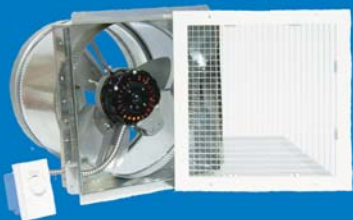
QC1500 GA Garage to attic fan