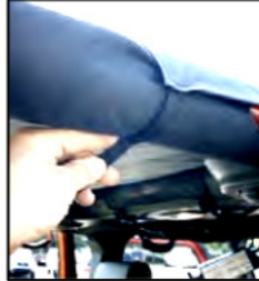
Step 6 (B)

Step (6) : Attach side Velcro straps over and around roll bar and plastic door brackets as shown. Note: Straps will need to run between plastic side rail on summer top and plastic door brackets as shown. If top is used without plastic door brackets then Velcro straps are to be looped around side roll bars and secured.