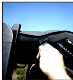
Step 8 (C)