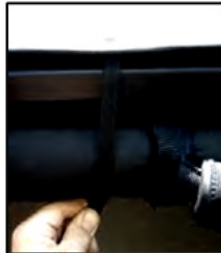
Step 6 (A)

Step (6) : Attach side Velcro straps over and around roll bar and plastic door brackets as shown. Note: Straps will need to run between plastic side rail on summer top and plastic door brackets as shown. If top is used without plastic door brackets then Velcro straps are to be looped around side roll bars and secured.