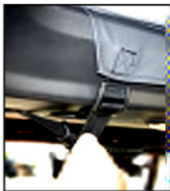
Step 8 (A)

Step (8) : With the left and right side Velcro straps secured and plastic side rails secured proceed to pull the center cross bar straps, rear side straps, and side straps tight.