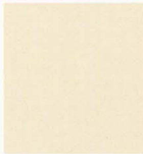
Almond C 920-58 920-PC