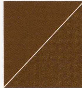
Dark Chocolate* C 2200-MC 2200-PC