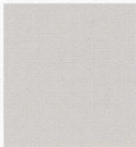
Folkstone 927-58 927-PC