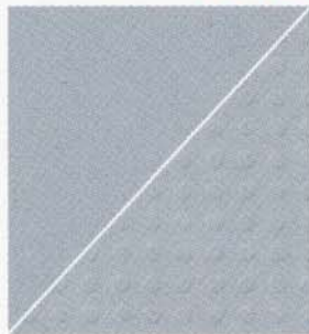
Steel* 1484-MC 1484-PC