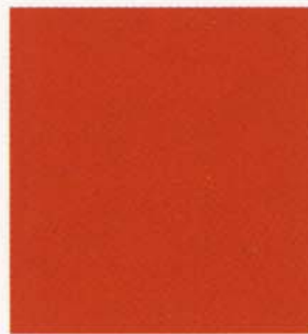
Stop Red 839-58 839-PC