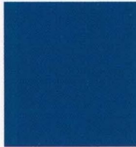
Marine Blue C 914-58 914-PC