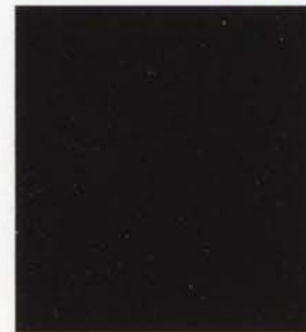
Black 909-58 909-PC