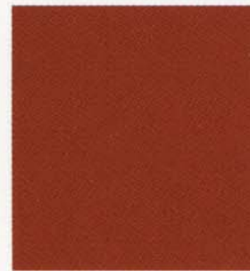
Burgundy C 966-58 966-PC