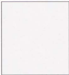
White C 949-58 949-PC