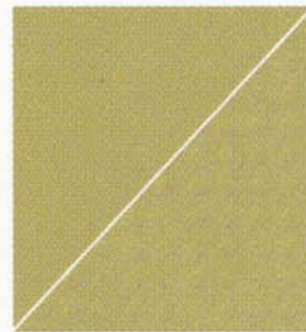
Organic Green* C 6904-MC 6904-PC