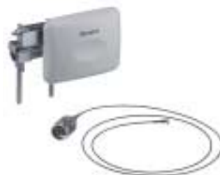
SNCA-AN1 Wireless LAN Antenna (for use with SNCA-CFW1 Wireless Card)