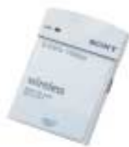
SNCA-CFW1 Wireless Card