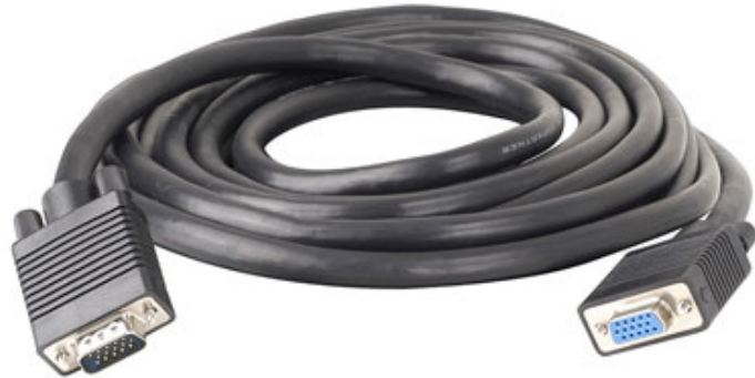
Ultra-Hi-Grade VGA Cable 6 feet (G2LVGAE006) Ultra-Hi-Grade VGA Cable 6 feet